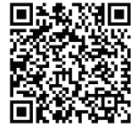
Taq Grif ACB